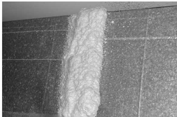
FIGURE 1—DUCT JOINT SEALING

1 R-values are based on tested k -values at 2-inch thickness.